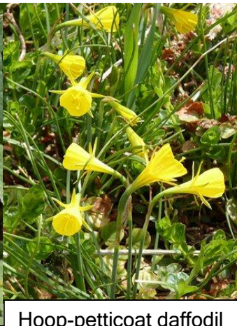
Hoop-petticoat daffodil Narcissus bulbocodium