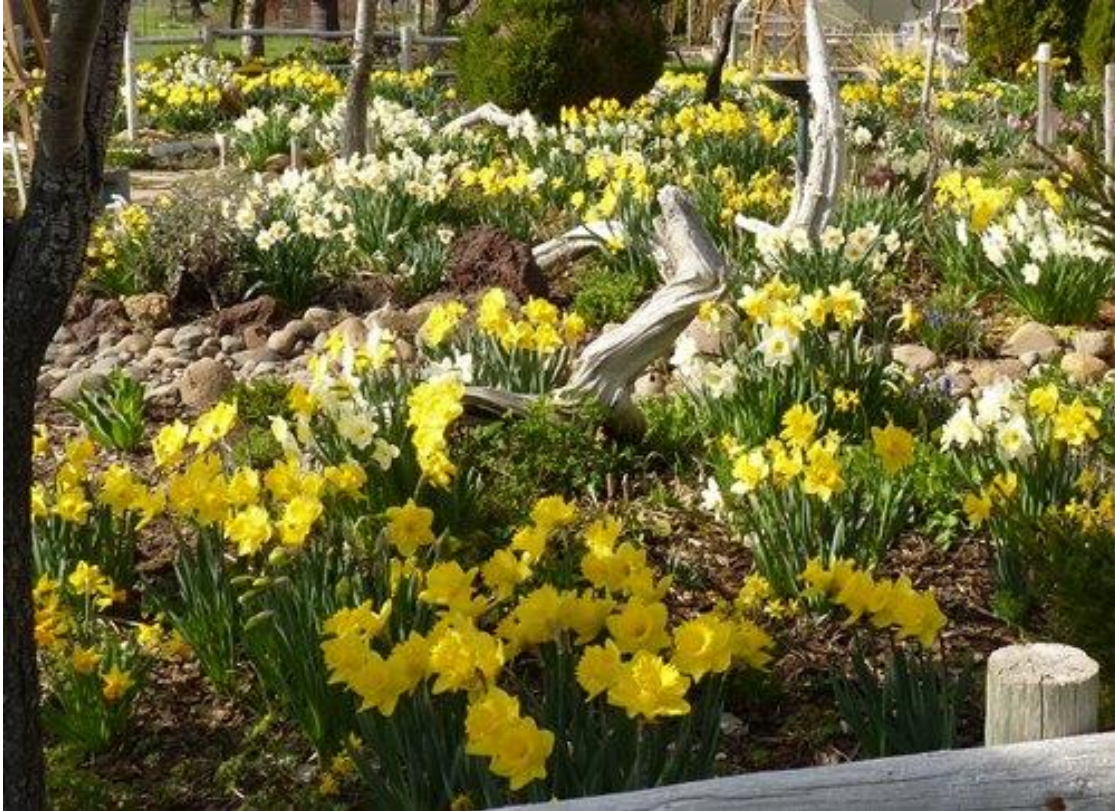
Yati's daffodils.