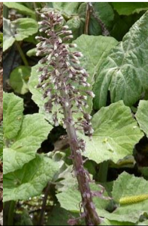
Japanese Coltsfoot Petasites japonicus