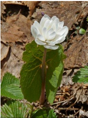
Double bloodroot Sanguinaria canadensis mutiplex