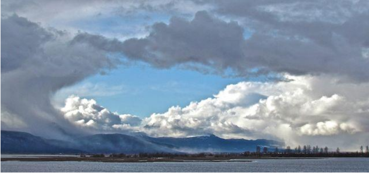
Clearing storm across Agency Lake.